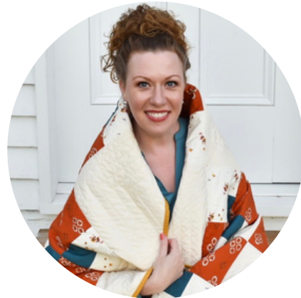
WITH BELLE OF SEAMS SEW ME

Have you ever wanted to make the cathedral window block but were intimidated by the old envelope method? If so, you will love learning how to make this beautiful block, which we will turn into a 20 x 20 pillow, using a modern easy method ! Come join the fun and gain the confidence of mastering the cathedral window!